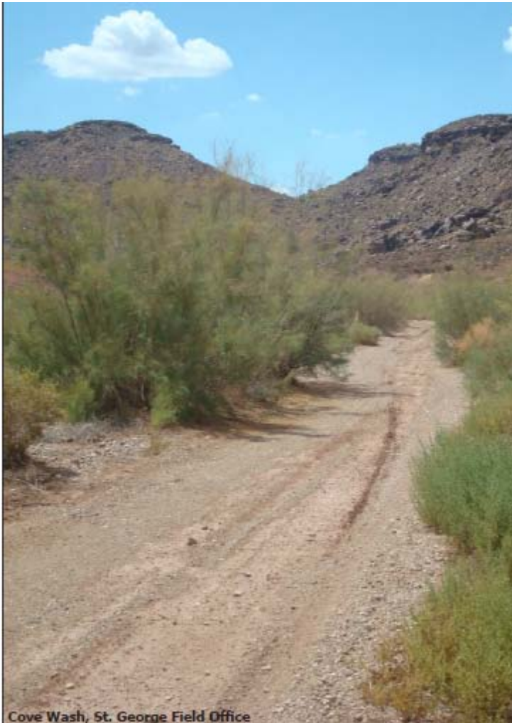
Cove Wash, St. George Field Office