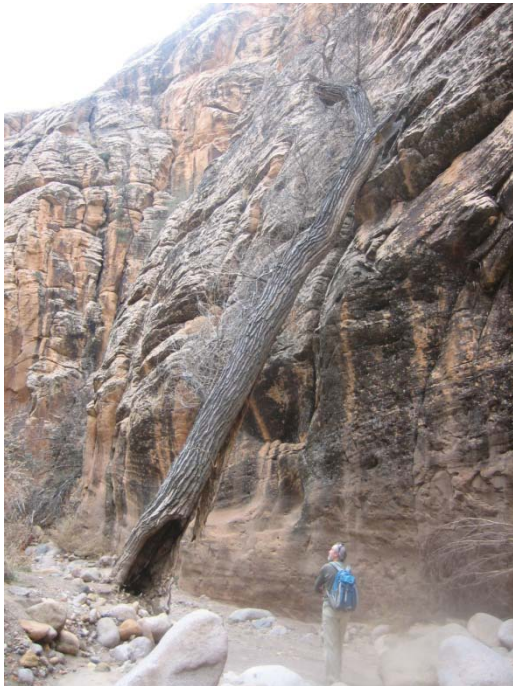
Cottonwood Wilderness Area

The uses of wilderness include protection of air and watersheds; maintenance of soil and water quality, ecological stability, plant and animal gene pools, protection of archaeological and historical sites, habitat for wildlife; and livestock grazing. Wilderness provides opportunities for outdoor recreation including hunting, fishing, photography, hiking, horseback riding, guiding and outfitting, scientific study of biological diversity, educational programs, investigating archeology and camping. Wilderness also provides for the exercise of valid existing rights such as water rights, mining claims, mineral leases, and rights-of-way these are controversial issues and I would just delete them.