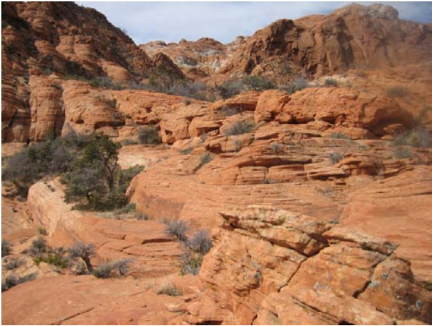
Red Mountain Wilderness Area

Wilderness is a legal designation designed to provide permanent long-term protection and conservation of Federal public lands. Wilderness is defined by the Wilderness Act of 1964 as “ an area where the earth and its community of life are untrammelled by man, where man himself is a visitor who does not remain... Federal land retaining its primeval character and influence, without permanent improvements or human habitation, which is protected and managed so as to preserve its natural conditions and which (1) generally appears to have been affected primarily by the forces of nature, with the imprint of man’s work substantially unnoticeable; (2) has